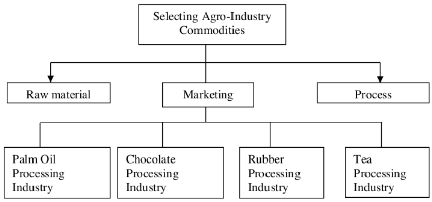
Figure 1. Examples of hierarchical structures in AHP